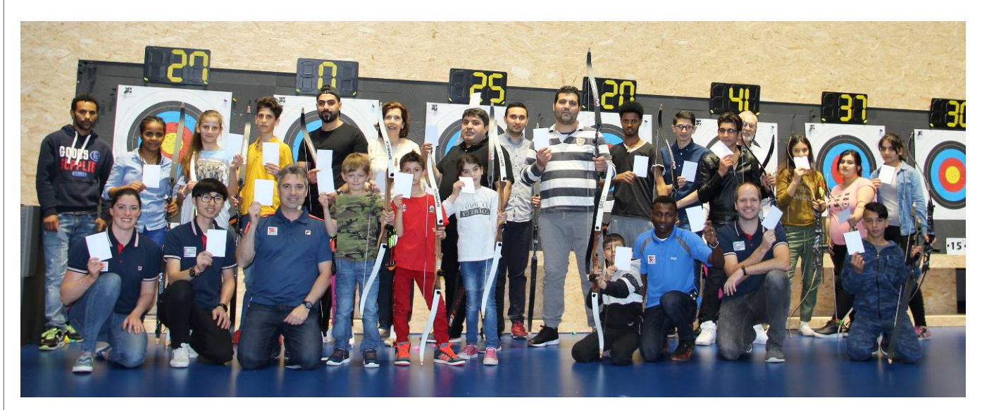
Peace and Sport Day at World Archery Excellence Centre in Lausanne

The International Day of Sport for Development and Peace was held on 6 April 2017. World Archery thank those who took part in the celebrations and activities.