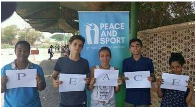
Peace and Sport Day in Djibouti