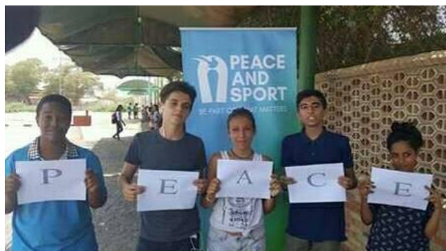
Peace and Sport Day in Djibouti