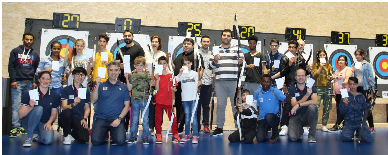
Peace and Sport Day at World Archery Excellence Centre in Lausanne

The International Day of Sport for Development and Peace was held on 6 April 2017. World Archery thank those who took part in the celebrations and activities.