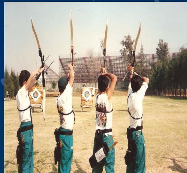
READY FOR PRACTICE