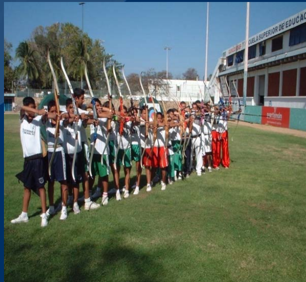
3 CELLS TOGHETER