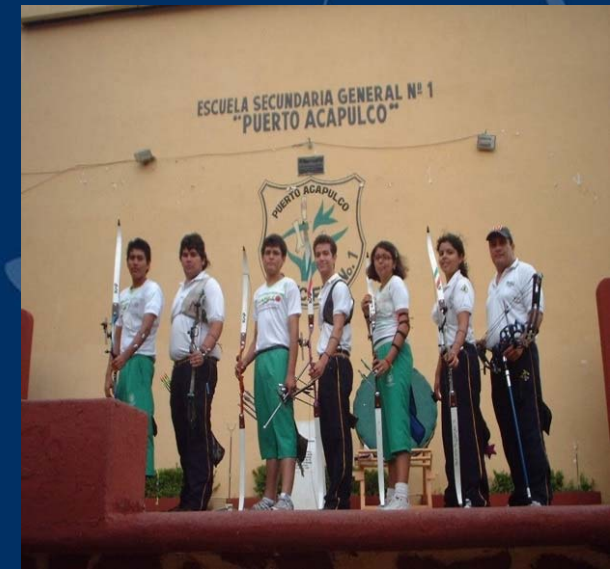
WE ARE READY