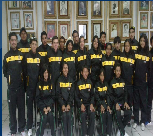
GROUP AT BAJA CALIF.