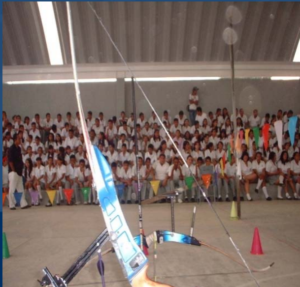
WHAT IS THIS ABOUT