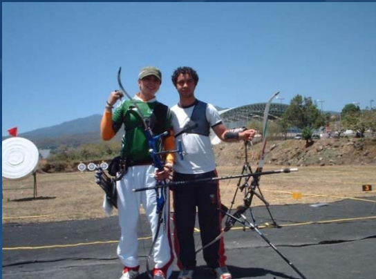
AIDA AT MORELOS