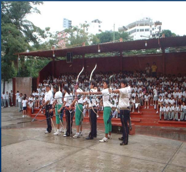
STRAIGHT ON TARGET