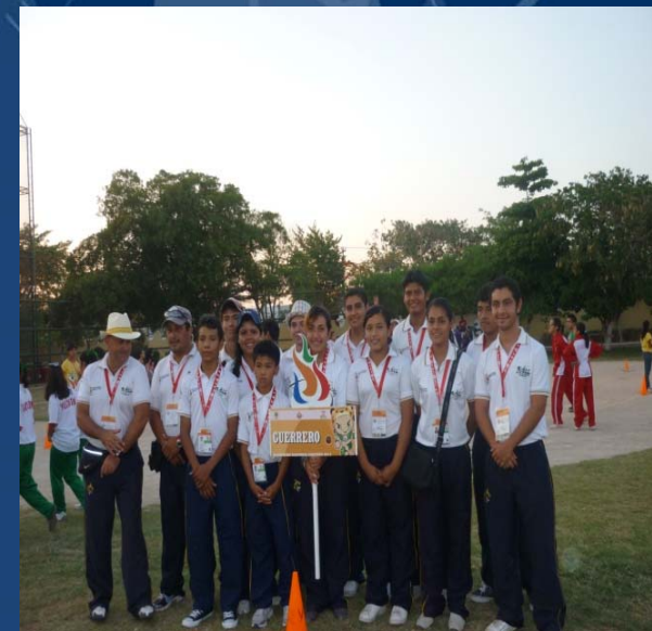
GROUP AT YUCATAN