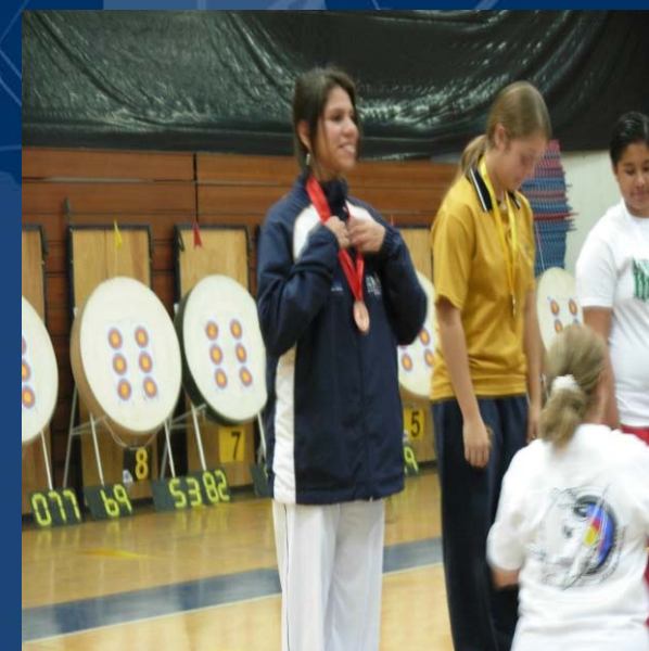
PRIZING AN EFFORT