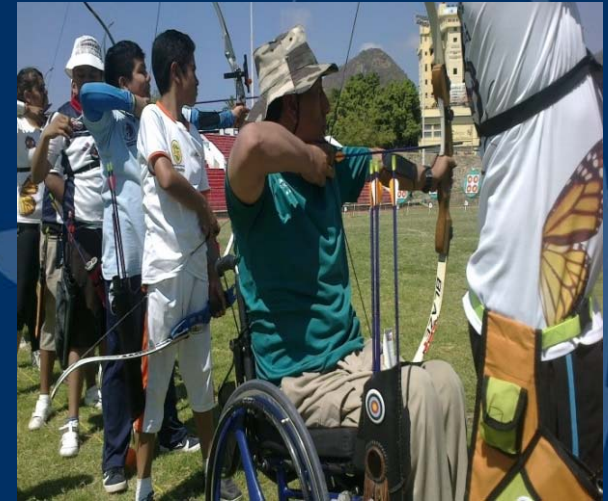
COMPETING FOR MY STATE