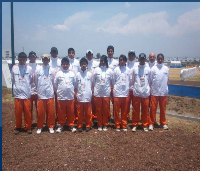
GROUP AT PUEBLA