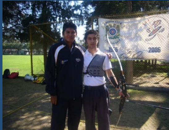
GUERRERO AT UNAM