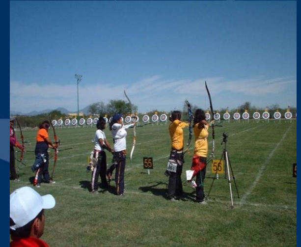
GIVING THE "MAX"