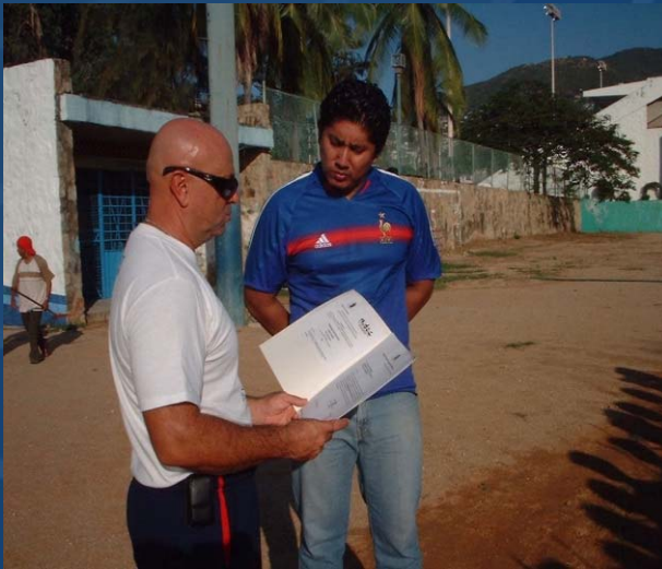
TRAIN THE TRAINER