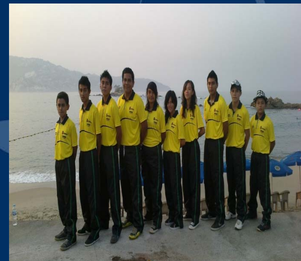
GROUP AT MEXICO