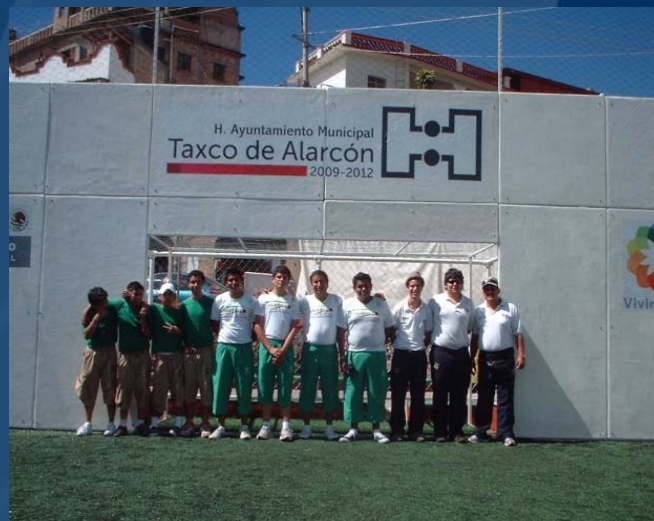
GROUP AT JALISCO