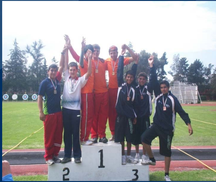
LEARNING TO WIN