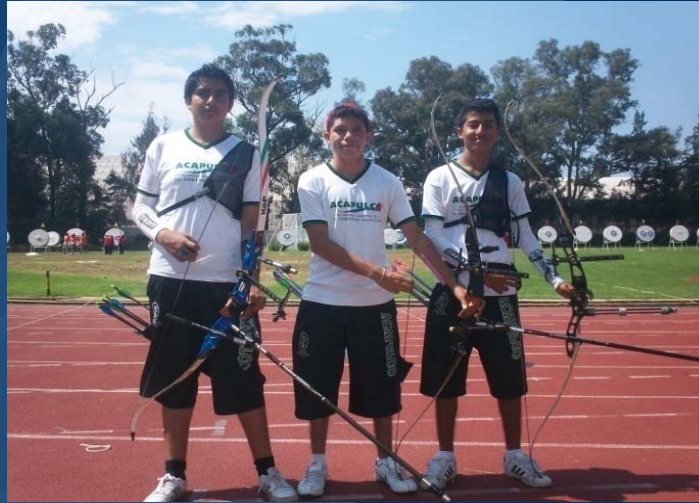
READY TO COMPETE