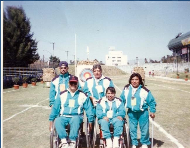
WHEELCHAIR NAT'NAL TEAM