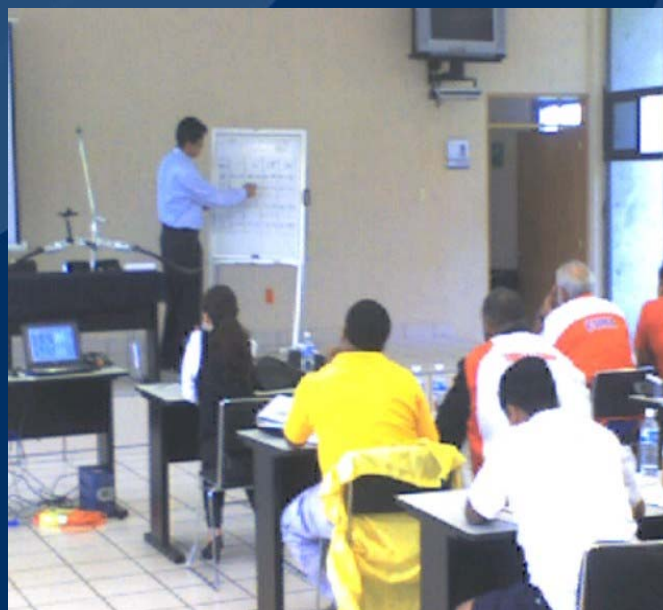
OLYMPIC SOLIDARITY COURSE