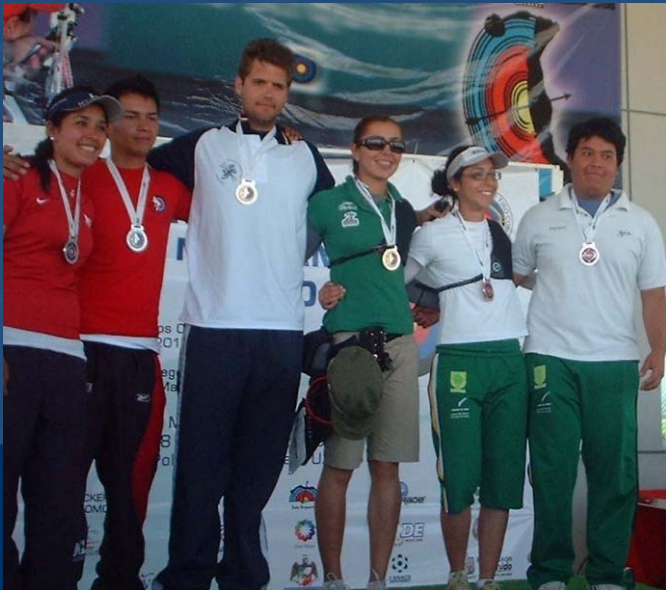
LOOKING TO BE THE BEST