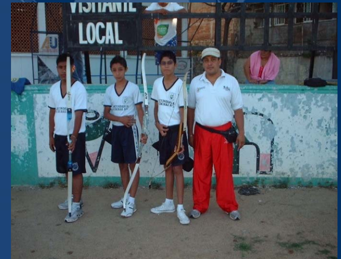
PHISICAL ED Bs, AND AND SCHOOL CELL