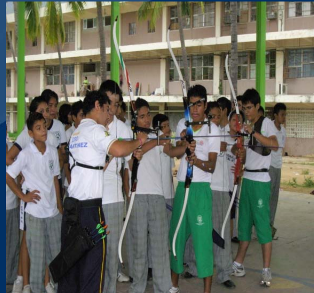
FEELING OF SHOOTING