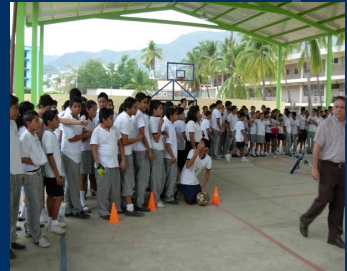
SPEAKING OF THE SPORT