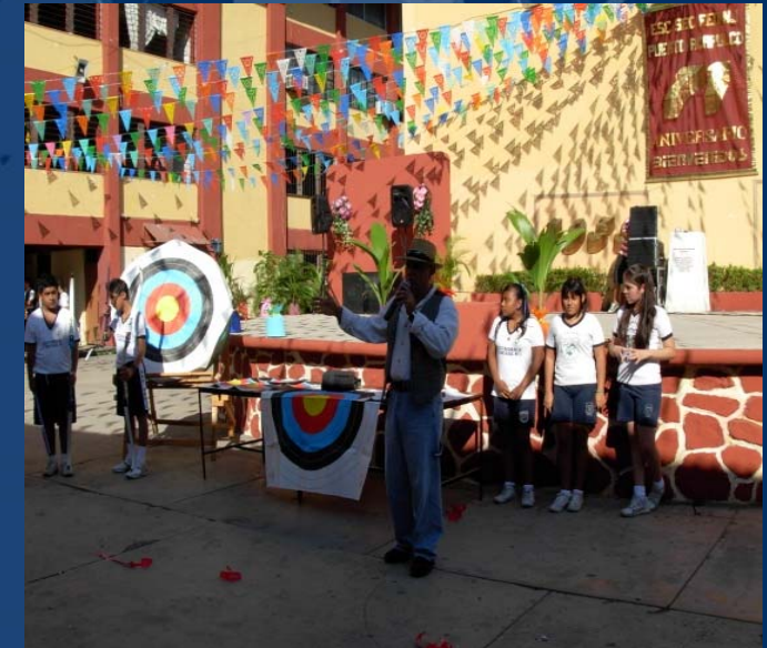
STARTING A CELL