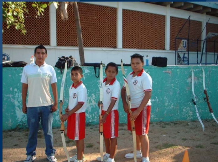
SCHOOL CELL INSTRUCTOR