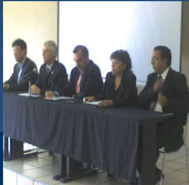
COURSE ON PSYCHOLOGY