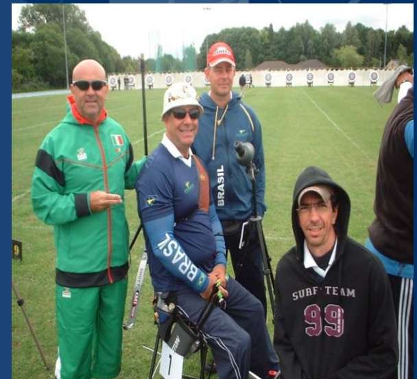
LEARNING FROM THE BEST