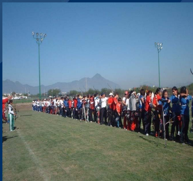
FROM AGE 11 TO 22